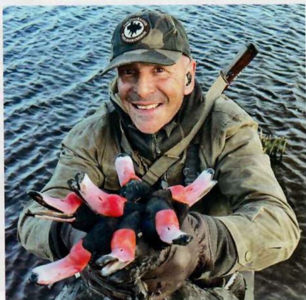
Beautiful rosybills harvested in Argentina.