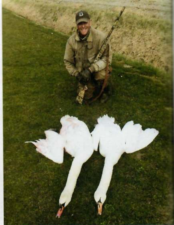
Stunning Tundra Swans above the Arctic Circle.