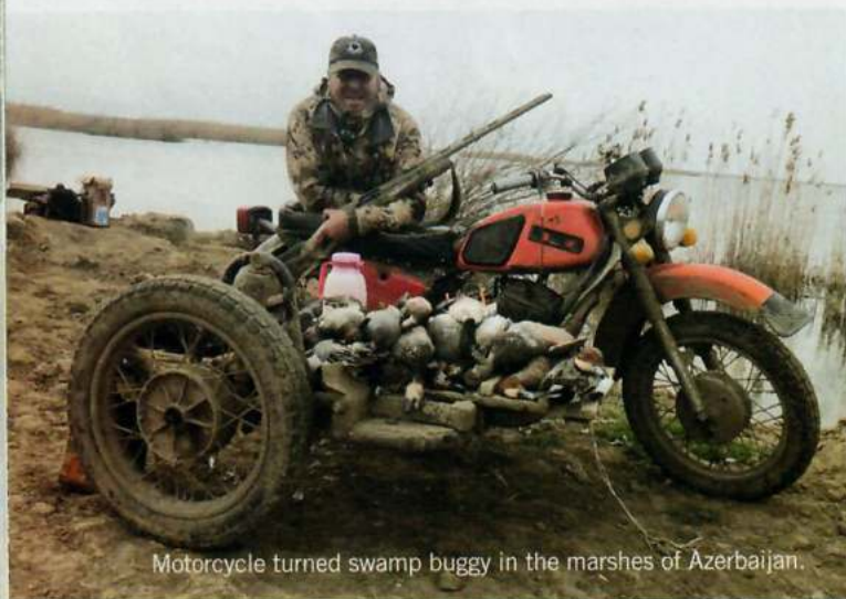
Motorcycle turned swamp buggy in the marshes of Azerbaijan.