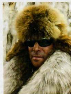
Typical, and quite stylish while warm, duck hunting attire in Mongolia.